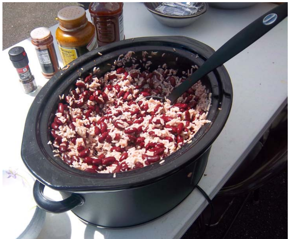
Beans & Rice @ a 2011 PMC Rest Stop (Photo submitted by Steve Brown).