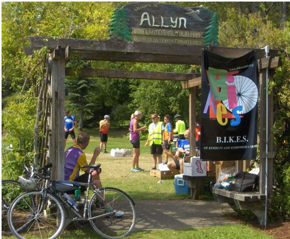
Volunteers from B.I.K.E.S have the Rest Stop in Allyn along the waterfront park, on the first day of RAPSody (Photo submitted by Kristin Kinnamon).

(By the way, RAPSody always helps promote TWBC’s Events - the Daffodil Classic & Peninsula Metric Century are both RAPSody Training Rides.) ☺